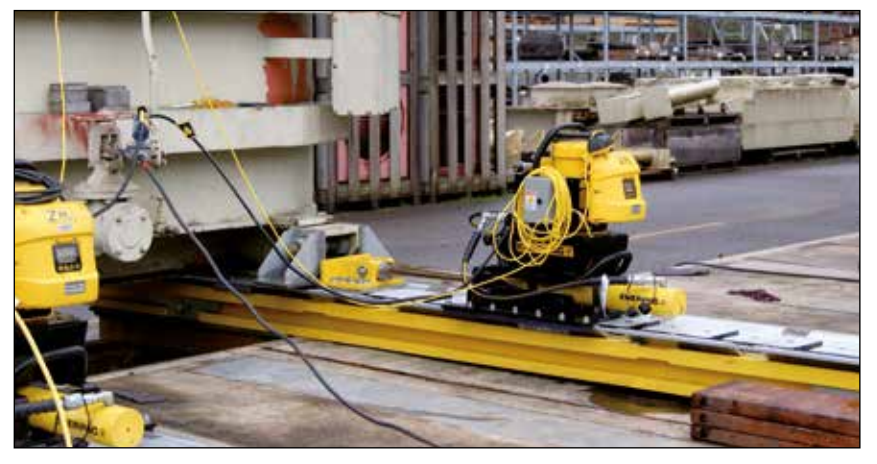
A custom hydraulic Low Height Skidding System (HSKLH) will provide the maintenance team with the ability to maneuver and transport transformers with physical access limitations.

Manual controls offer a cost-effective solution by utilizing manual hydraulic valves mounted directly on the skidding system power unit.